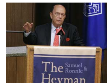
Legendary investor Wilbur Ross provided his views on the credit crisis and the outlook for investors when he was the keynote speaker at the 2008 Restructurings Conference.

Fresh from attending a series of meetings in Washington with SEC Chairman Christopher Cox and congressional leaders, Internal Markets Commissioner Charlie McCreevy of the European Union delivered a major speech about the need to develop global standards for and greater regulatory cooperation among financial markets. He discussed the consolidation of US and European stock exchanges and the regulatory impact of such mergers. This marked the first time in more than a year that Commissioner McCreevy spoke before an American audience.