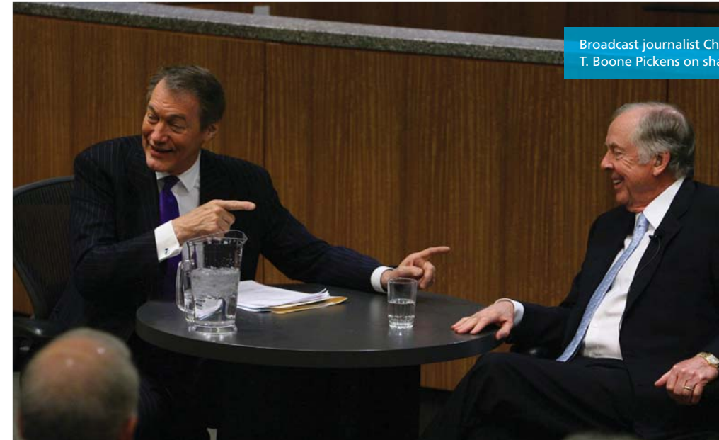
Broadcast journalist Charlie Rose interviewed T. Boone Pickens on shareholder activism.