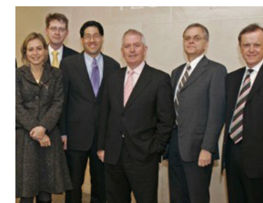
European Union Commissioner Charlie McCreevy (center) visited Cardozo for a speech on Building the Transatlantic Marketplace.

“Through The Heyman Center, students have the opportunity to meet leading lawyers, business figures, and policymakers, develop professional contacts, and get an early start on their careers. They have access to a unique educational experience available only in New York, which is supplemented by international programs that prepare them for jobs in the global marketplace.”