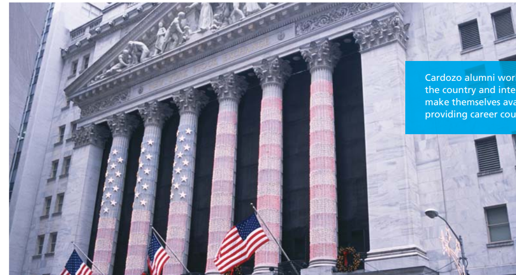
Cardozo alumni work throughout the country and internationally and make themselves available to students, providing career counsel and assistance.