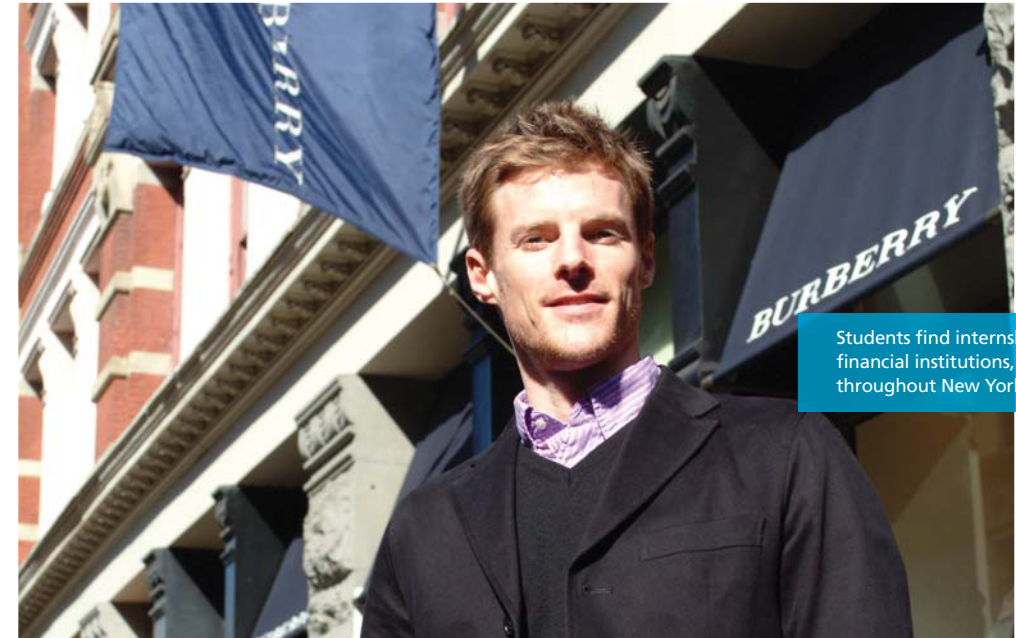
Students find internships at corporations, financial institutions, and businesses throughout New York City.