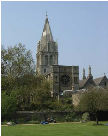
A popular summer program in comparative corporate governance is held at venerable Oxford University.

This two-week summer program introduces students to the corporate law systems of the United States, the United Kingdom, Germany, and other jurisdictions. Students live and attend seminars taught by Cardozo faculty at Oxford University. Students also spend a day in London visiting international law firms, meeting leading practitioners, and learning at first hand about recent cross-border transactions. Cardozo students receive academic credit upon completion of a research paper.