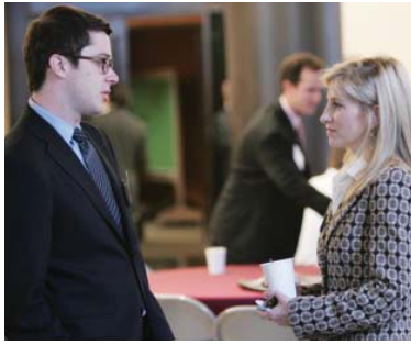
Cardozo's Office of Career Services schedules many opportunities for students to meet with employers formally and informally.