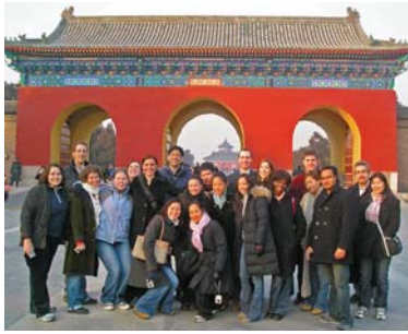
Students with an interest in business law can spend time in China studying the country's developing legal system.